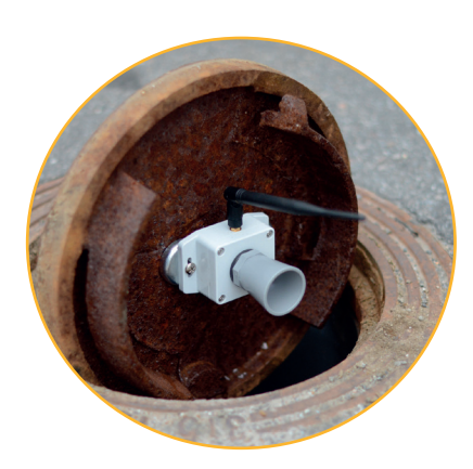
ELT-2 and maxbotix mounted